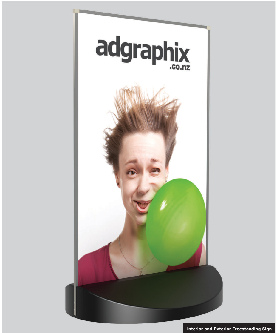
Interior and Exterior Freestanding Sign