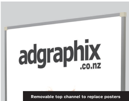
Removable top channel to replace posters